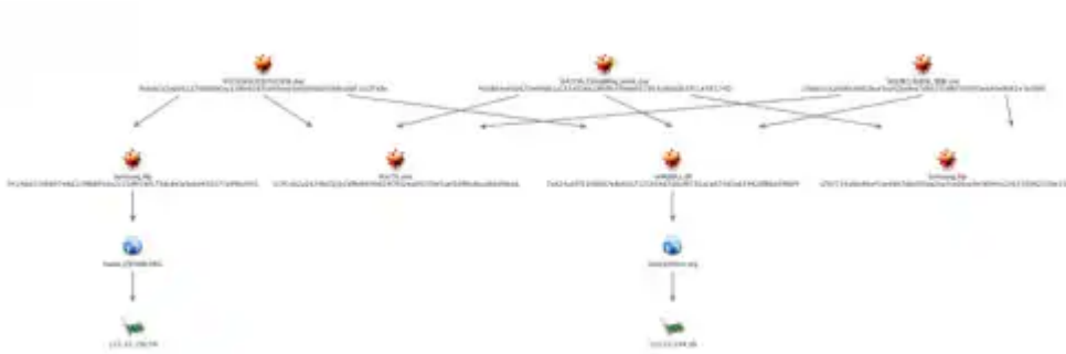
Figure 1. Malicious RARs and the three files within

In addition to the new variant we discovered, Japan’s Computer Emergency Response Team Coordination Center (JPCERTCC) published a blog last July on a different new variant. That variant is also side-loaded from a legitimate executable and stub DLL, but the shellcode isn’t encoded the same way as SPIVY. JPCERTCC didn’t comment on who was being targeted in their blog, but it is notable that two distinct Poison Ivy variants have recently appeared, several years after the tool largely fell out of common use by advanced actors.