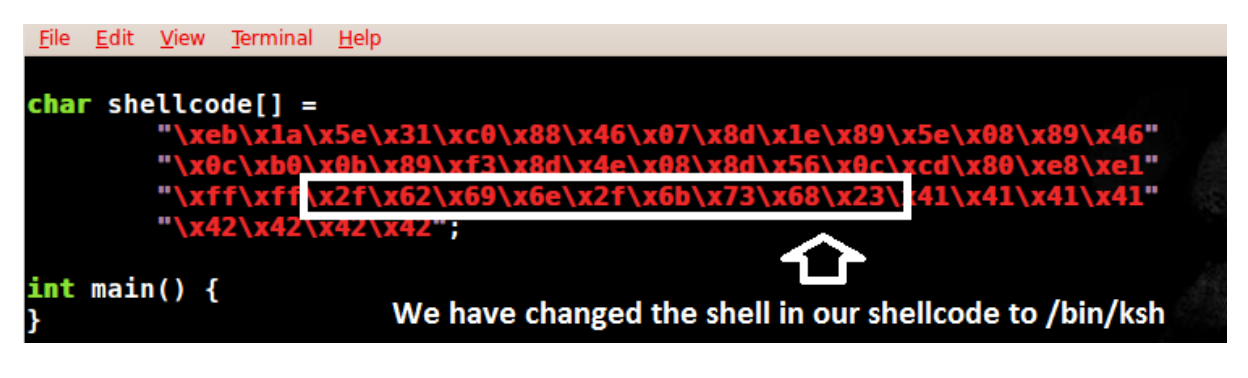
Figure 4: Altering the "shellcode".

With this simple change, we have altered the shellcode in a manner that allows us to control its objective.