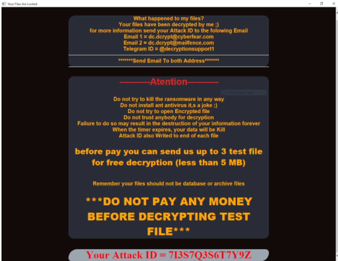
Figure 10: Ransom Note