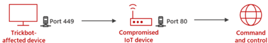
Figure 2. Direct line of communication between the Trickbot infected device and the Trickbot C2

The attackers then issue a unique command that redirects traffic between two ports in the router, establishing the line of communication between Trickbot-affected devices and the C2. MikroTik devices have unique hardware and software, RouterBOARD and RouterOS. This means that to run such a command, the attackers need expertise in RouterOS SSH shell commands. We uncovered this attacker method by tracking traffic containing these SSH shell commands.