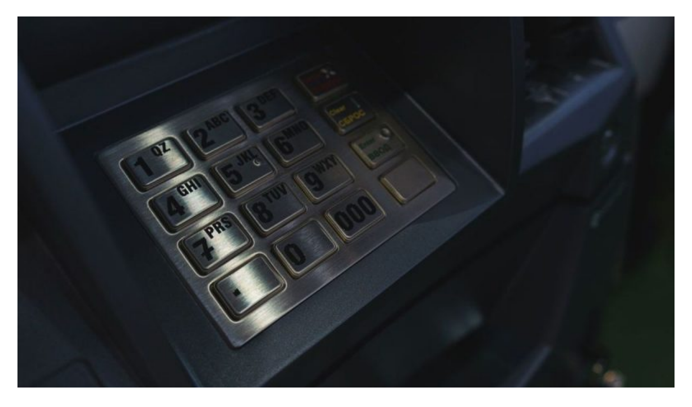
Criminals, ATMs and a cup of coffee