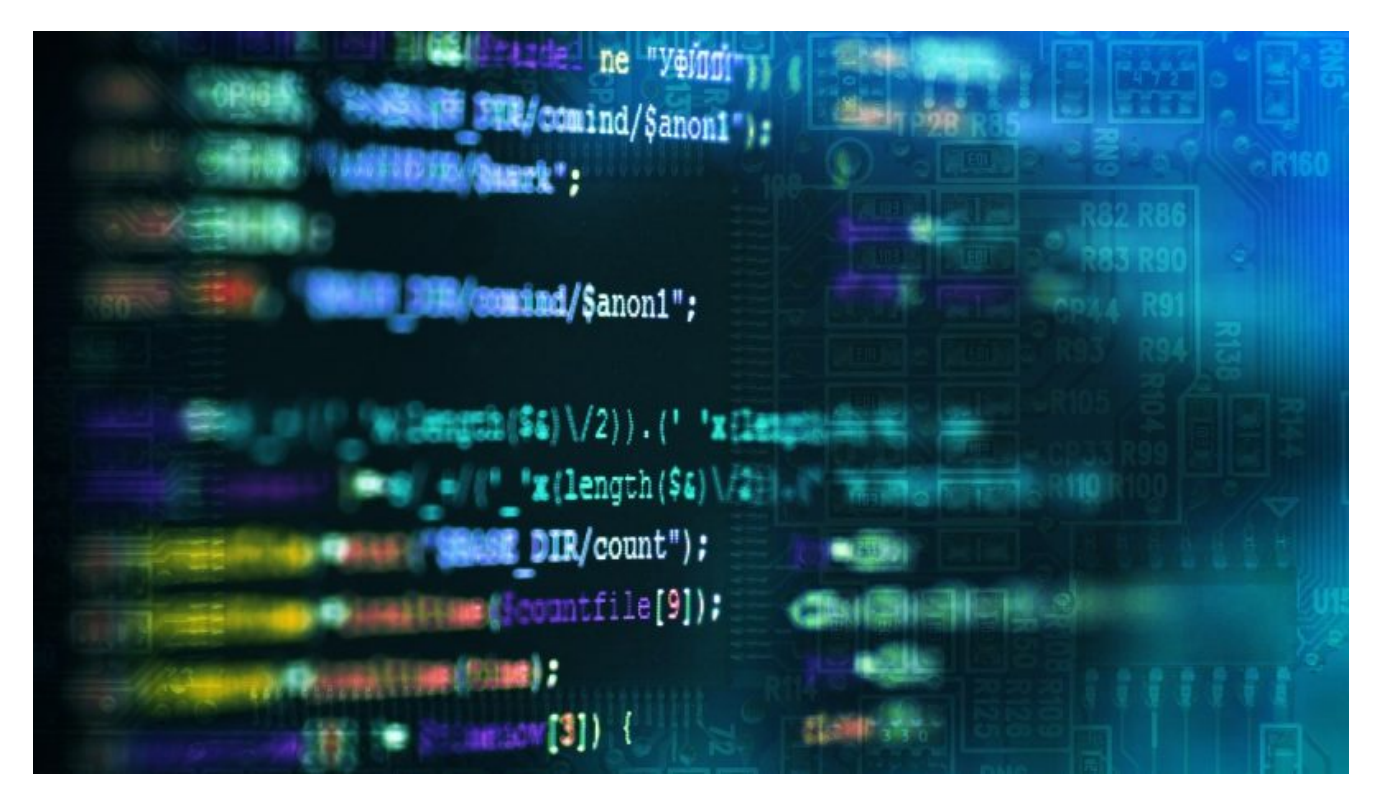
How we developed our simple Harbour decompiler