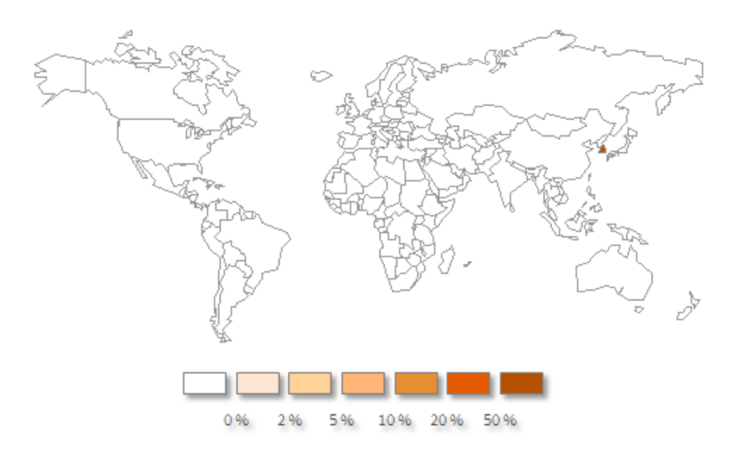
Figure 2. Heatmap of Castov antivirus detection from January to May 2013

The combination of screenshots, passwords, and digital certificates will allow the cybercriminals to access users' financial accounts.