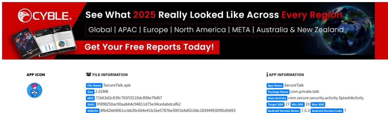
Figure 1 – App Metadata Information

Figure 1 shows the metadata information of the application .