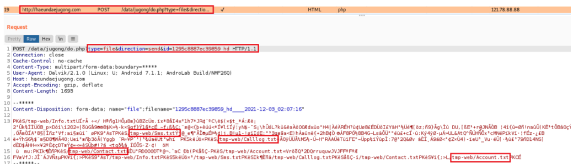
Figure 13 – Uploads Sensitive Data to the TA's C&C

The below figure shows that the application uploads sensitive data such as contacts, call logs, and SMSs from the device to TA's C&C.