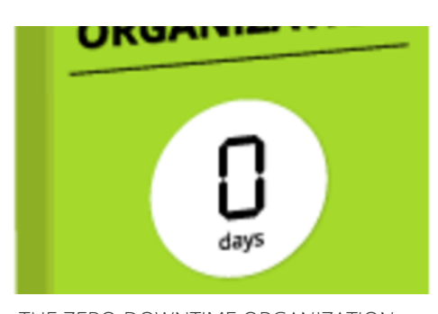
THE ZERO-DOWNTIME ORGANIZATION