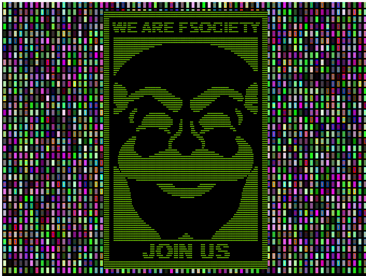
Figure 2 – The picture displayed by KillDisk malware in the first wave of December 2016 attacks.

In the second wave of attacks, the cybersaboteurs behind the KillDisk malware added contact information to the malware, so it would look like a typical ransomware attack. However, the attackers asked for an extraordinary number of bitcoins: 222 BTC (about $250,000 at that time). This might indicate that they were not interested in bitcoins, but their actual aim was to cause damage to attacked companies.