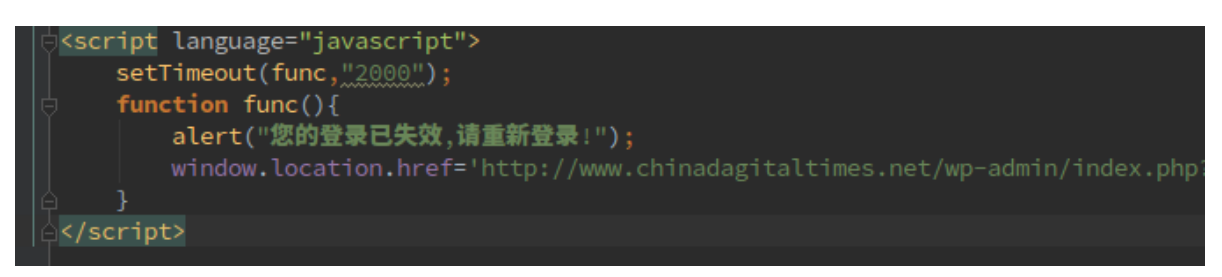
Figure 2: Snippet of Javascript code in the source of the fake China Digital Times webpage.

Visually, the content is identical. The only substantive difference between the real and fake content is a few lines of javascript code (see Figure 2 ).