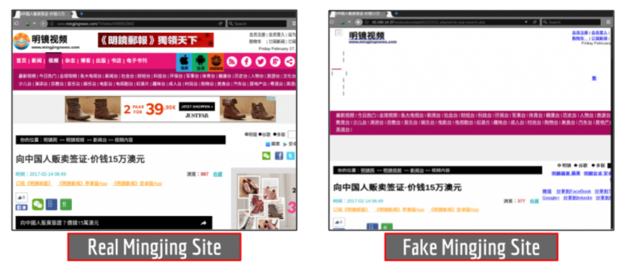
Figure 6: Comparison of the real and fake Mingjing news site

Four days after the first phishing email was sent to CDT we accessed the content on the page and found it served content copied from a Mingjing News article about illicit sales of Chinese visas (See Figure 6 for comparison of the real and fake content).