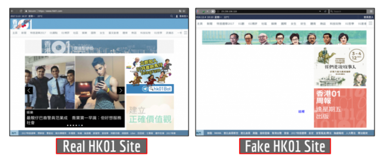
Figure 10: Comparison of real and fake HK01 webpages

When we first investigated the malware server on March 6, 2017 we found it was hosting what appears to be a copy of the frontpage of HK01, a Hong Kong-based news site (see Figure 10 ).