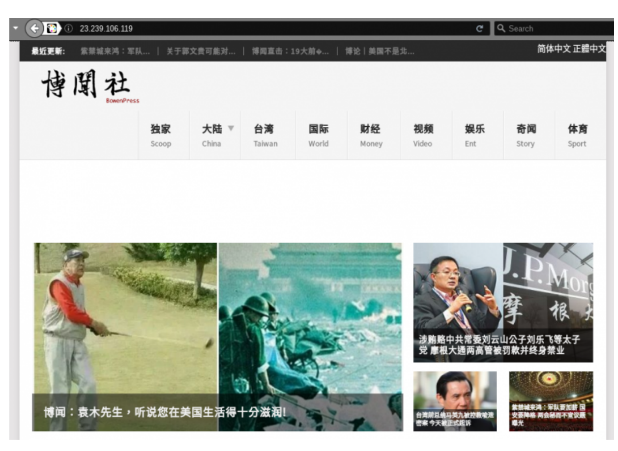
Figure 14: Screenshot of the malware server on March 15 2017 showing copied content from Bowen Press.

The only change to the content of the page was the removal of a bot check supplied by WordFence, a security plugin for the WordPress blogging platform. On March 21, the content was removed and the server returned a blank page.