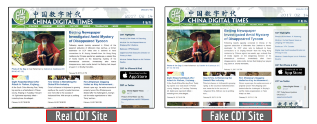
Figure 8: Comparison of the real frontpage of CDT (as seen on day the emails were sent) and the fake webpage

Between February 14 and 28, 2017, a direct visit to the URL hxxp://43[.]240[.]14[.]37 returned a copy of the CDT homepage (see Figure 8 ).