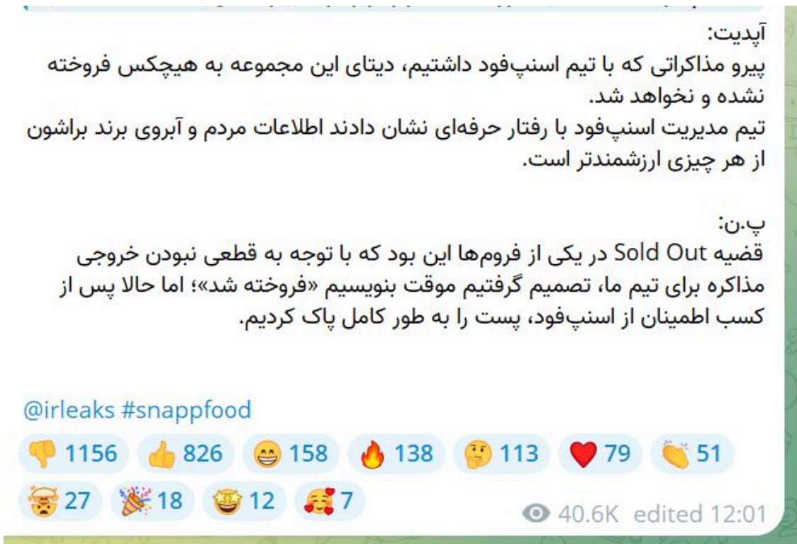
Telegram post by irleaks confirming the agreement

Nevertheless, if both parties adhere to their agreement, it could be deemed a positive outcome for the company and its customers. Hackread.com has reached out to the hackers for a potential interview about the data breach, and this article will be updated accordingly if they respond.