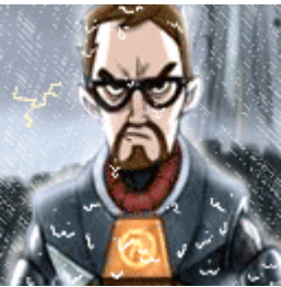
Figure 4. Animated GIF “anyway.gif” from UPS Campaign Exploiting CVE-2014-1776