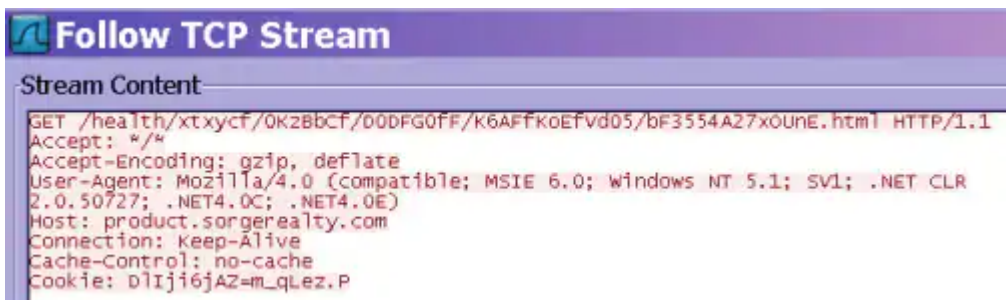
Figure 5. Pirpi.2014 C2 Communication using Cookie Field for Exfiltration

The Pirpi.2014 and Pirpi.2015 payloads communicate with their C2 by issuing HTTP GET requests to the C2 domain hardcoded inside the payload or within its “vcl.tmp” configuration file. While the structure of the C2 URL differs between the two variants, both use the HTTP Cookie field to transmit data in encrypted form to the C2 domain. Figure 6 shows examples of C2 communications from Pirpi.2014 and Figure 7 shows communication with the C2 of Pirpi.2015 malware variants, both containing data within the Cookie field.