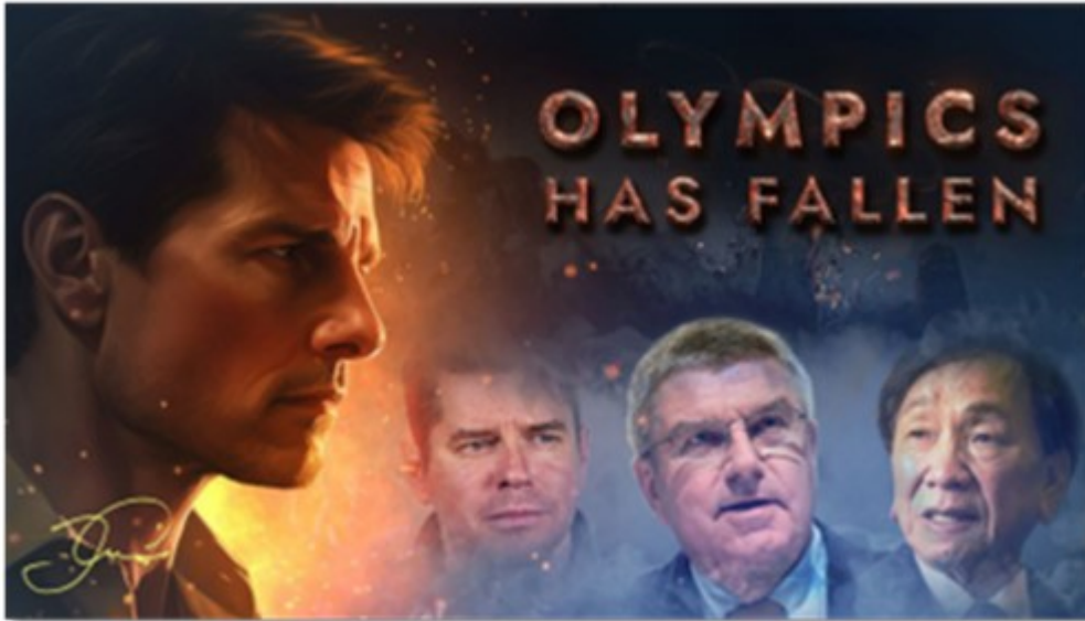
Figure 1: A visual from the fake documentary “Olympics Has Fallen”, produced by Russia-affiliated influence actor Storm-1679, which targets the International Olympic Committee and advances pro-Kremlin disinformation. The documentary uses the image and likeness of American actor Tom Cruise, who did not participate in any such documentary.

Olympics-focused activity kicked off in June 2023, when Storm-1679 released on Telegram and then spread online a feature-length film called “Olympics Has Fallen”, mimicking the 2013 American political action thriller “Olympus Has Fallen”. Using a fake AI-generated audio impersonating the actor Tom Cruise to imply his participation, the film disparaged the IOC leadership. The use of slick computer-generated special effects and a broad marketing campaign, including faked endorsements from Western media outlets and celebrities, indicates a significant increase in skill and effort compared to most Influence Operations (IO) campaigns.