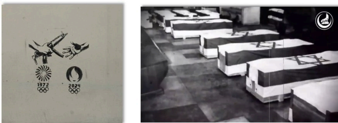
Figure 3: An image of graffiti, reportedly left in Paris, threatening a repeat of the 1972 Munich terror attacks at the upcoming Olympic Games in Paris (left). A still image from the false-flag terror threat, purportedly from Turkish ultranationalist group the Grey Wolves, whose symbol is visible in