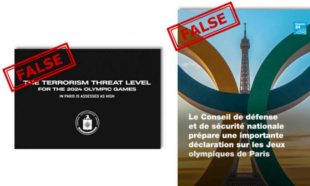
Figure 2: A faked video press release warning the public of possible terror attacks at the 2024 Paris Summer Olympics (left). A fabricated France 24 news clip claiming that nearly a quarter of Paris 2024 tickets have been returned due to concerns over terrorism (right). Both forgeries were produced by Russia-affiliated actor Storm-1679.