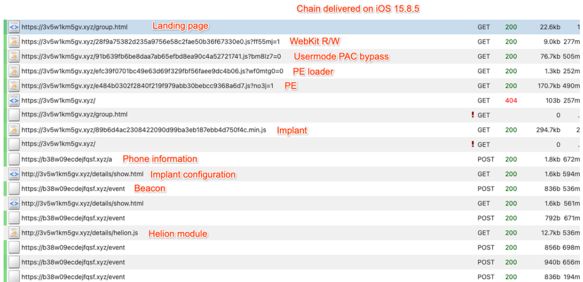
Figure 6: Coruna exploit chain delivered on iOS 15.8.5