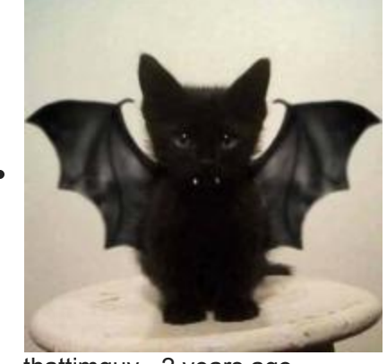
thattimguy - 2 years ago