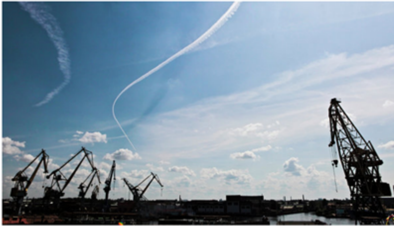
Figure 2. The attackers used the titles of news articles from a Russian media site for their malicious files' names

По словам главы Объединенной судостроительной корпорации Алексея Рахманова, есть понимание, что к концу 2016 года первые газотурбинные агрегаты российского производства уже будут испытаны и готовы к реализации на самих проектах.