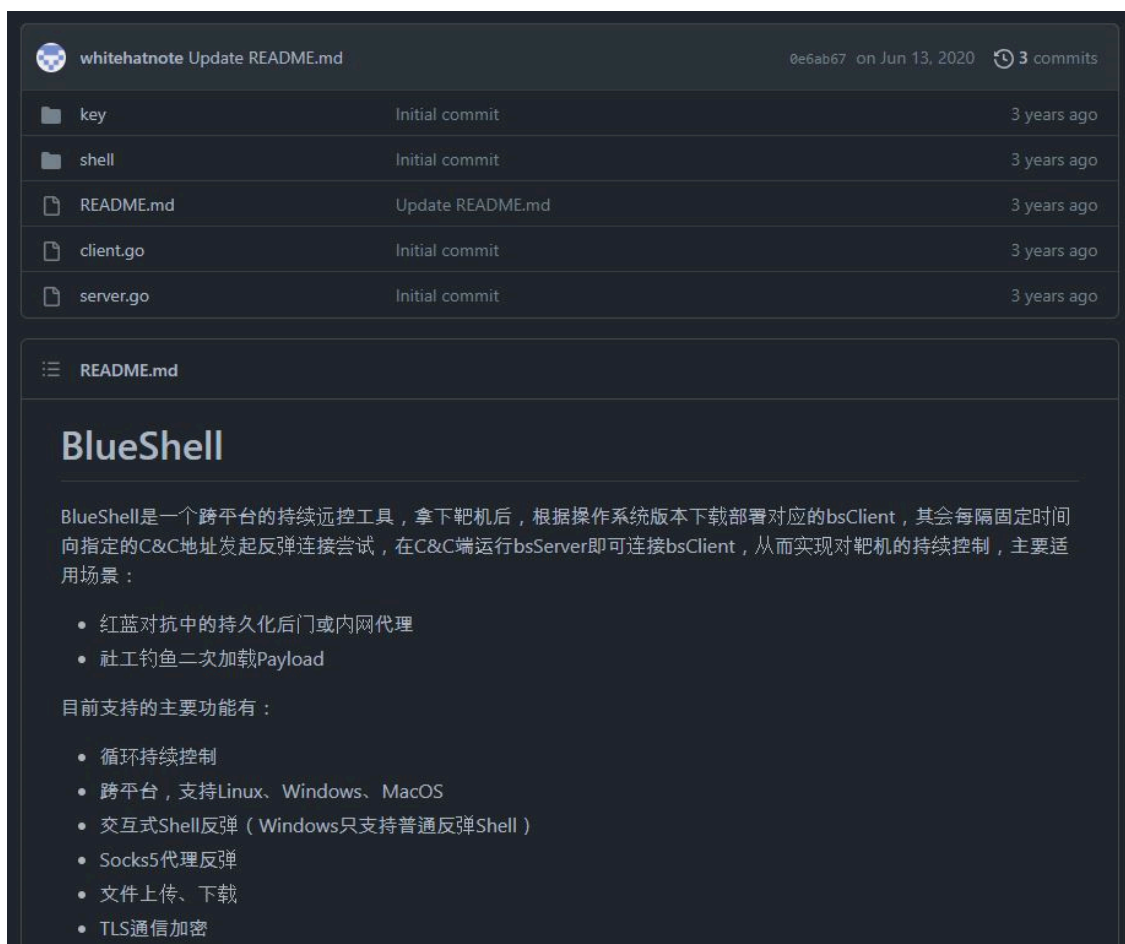
Figure 1. BlueShell published on GitHub

BlueShell is a backdoor developed in Go. It is available on GitHub and supports Windows, Linux, and Mac operating systems. Currently, it seems the original GitHub repository has been deleted, but the BlueShell source code can be downloaded from other repositories. Notably, the ReadMe file containing the guidelines is in Chinese, and this suggests that the creator may be a Chinese speaker.