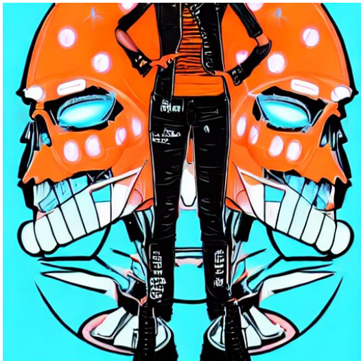
Apples and Oranges

DPRK-nexus Intrusion Sets, including Lazarus and Bluenoroff continued carrying out lucrative cyber campaigns , notably targeting cryptocurrency and financial technology-related activities. As previously mentioned, this includes part of Operation DreamJob conducted by Lazarus, whose financially motivated aspect was notably illustrated by the targeting of a Brazilian cryptocurrency company with NukeSped [13]. Of note, SEKOIA.IO assess it is likely that Brazil “Bitcoin Law” debates occurring in October 2021 [14] renewed Lazarus’ interest in targeting this country in lucrative motivated campaigns.