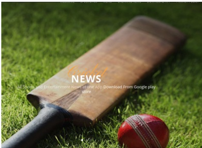
Figure 4. Malicious application for cricket news