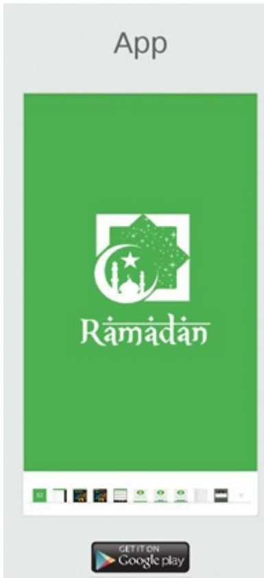
Figure 3. Malicious application for observing Ramadan