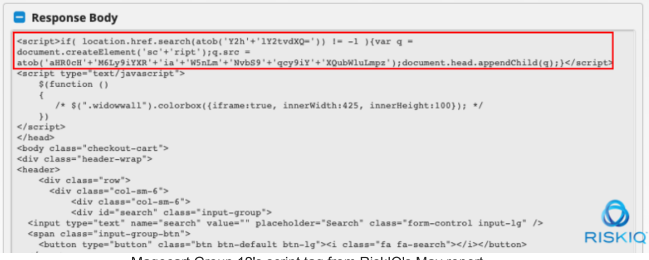
Magecart Group 12's script tag from RiskIQ's May report

"Most of Group 12's injections occur with a pre-filter on the page—a small snippet of JavaScript that checks to see if they want to inject their skimmer on the page. Here's what it looks like:"