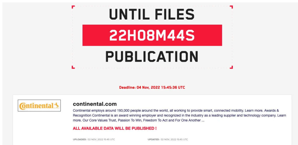
Continental entry on Lockbit's data leak site

Since LockBit says that it will publish "all available" data, this indicates that Continental is yet to negotiate with the ransomware operation or it has already refused to comply with the demands.