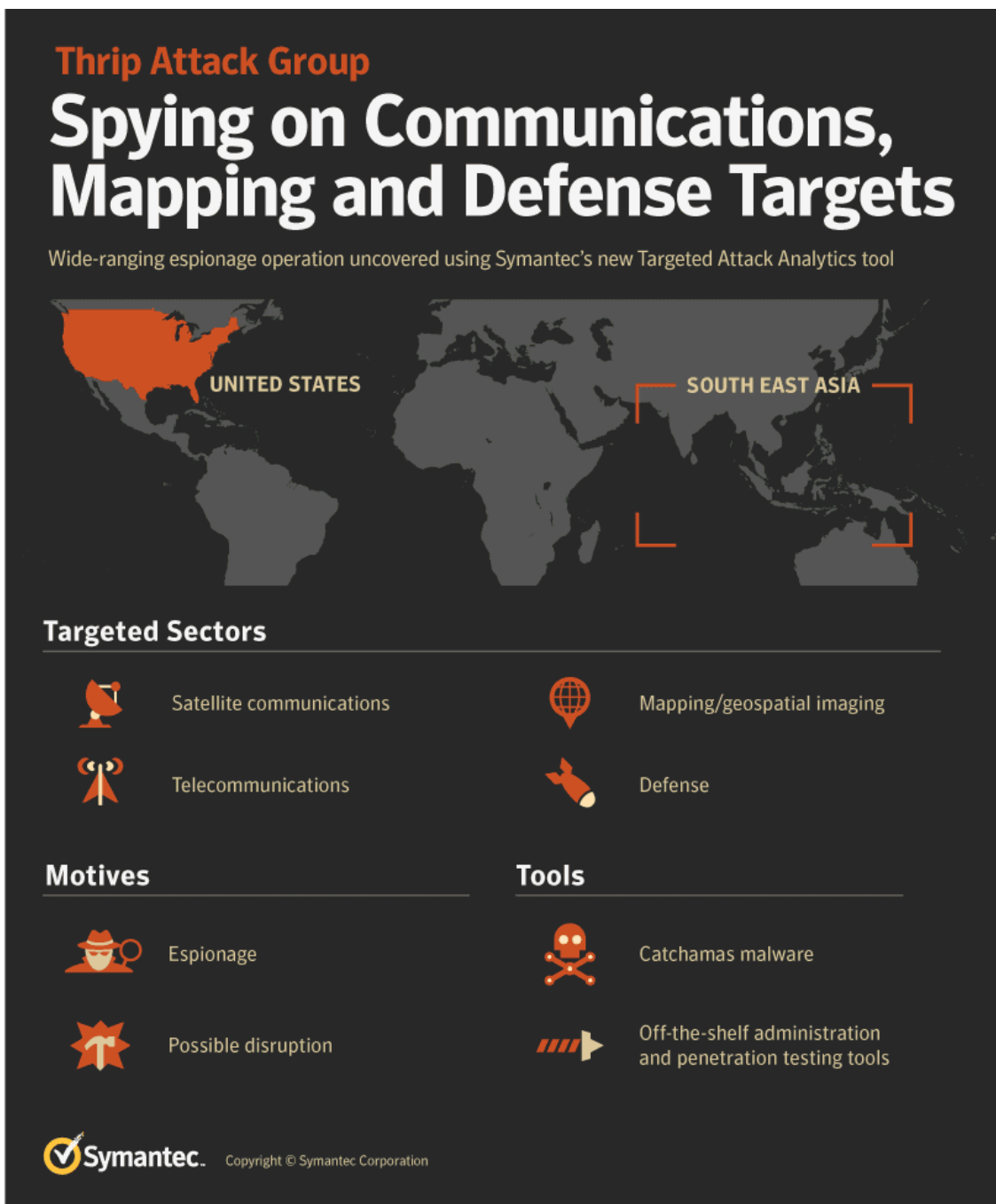
Figure 2. Thrip, spying on communications, mapping, and defense targets