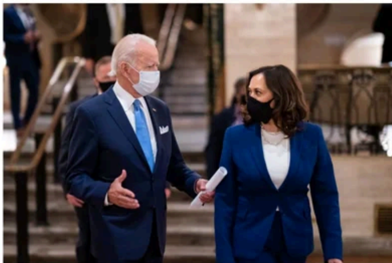
Joe Biden and Kamala Harris at a fundraiser in August 2020.

Figure 8: Top nuclear weapons issues decoy.