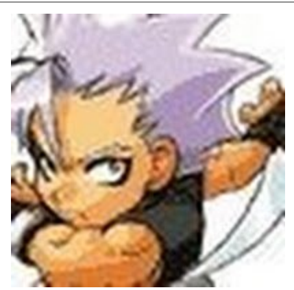
Exnor - 3 years ago