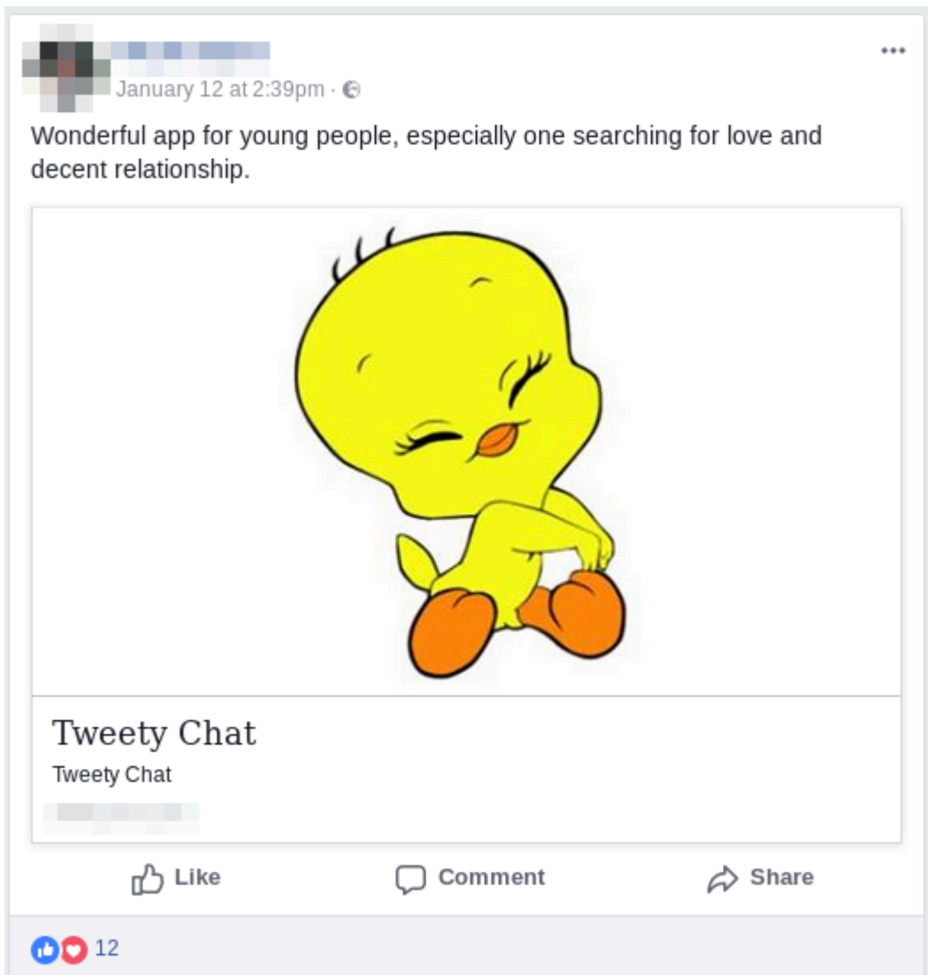
Figure 4: Screenshot showing Tweety Chat promoted in social media