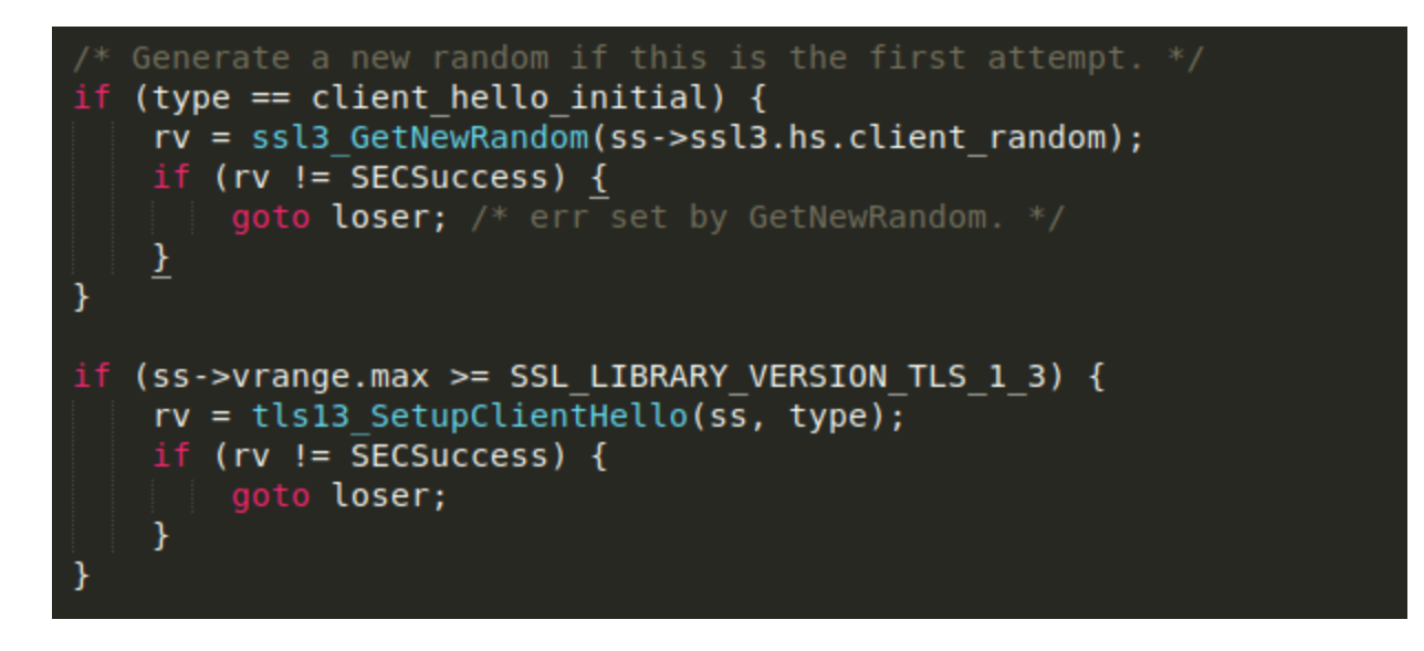
In order to patch browser PRNG memory functions and add unique user IDs into the TLS handshake, the developers of Reductor had to analyze Firefox and Chrome code