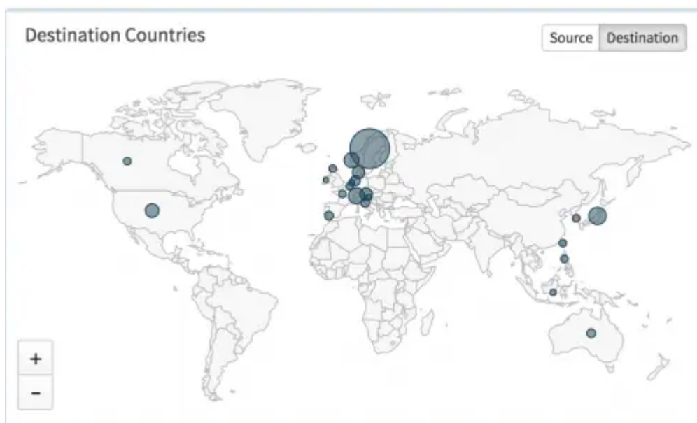
Figure 1: AutoFocus map of recent Retefe Trojan recipients

In the last two weeks we have detected a surge of e-mails using AutoFocus , each carrying the Retefe Trojan and targeting organizations in Western Europe and Japan.