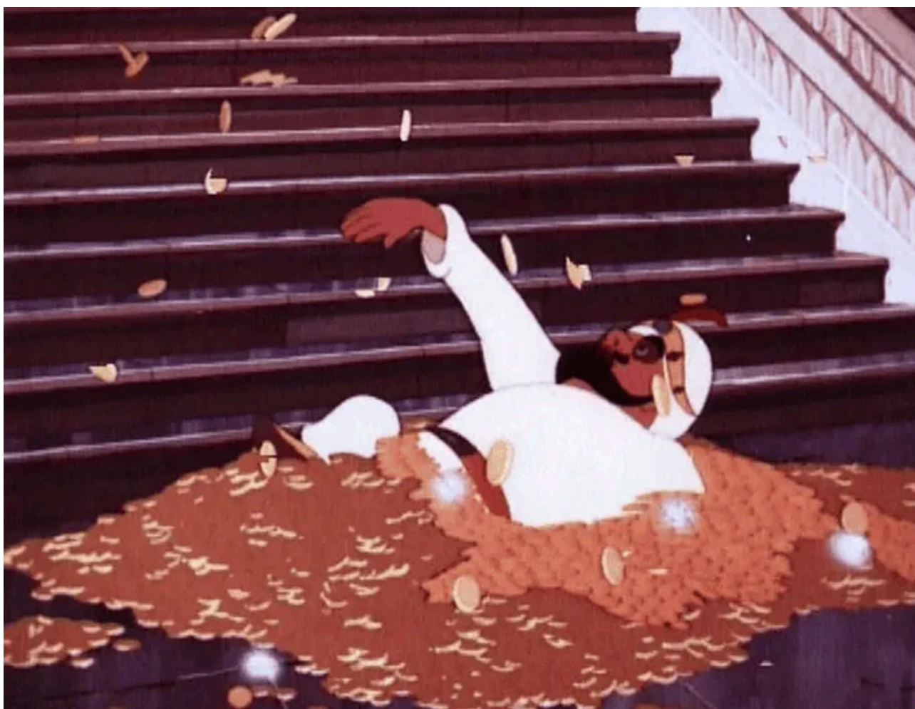
A greedy Raja drowns in gold in an Indian fairytale about a golden antelope

A: For us, it is easier because we have a perfect reputation and we are famous all over the world. For new affiliate programs, it will be harder to announce themselves and earn a reputation during the information blockade. So, this taboo on forums did us a favor. We do not need a large number of adverts because we know how the Indian fairytale about the [Golden] antelope has ended [an Indian fairytale with anti-greed morale – KELA]. When a certain amount of quantity and quality is reached, we close the recruiting process. It is easy to open an affiliate program but it is an art to keep it open.