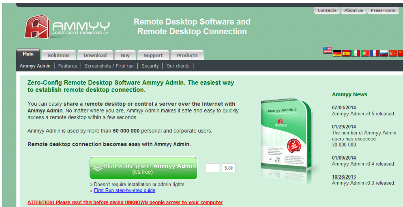
Figure 1 – Ammy.com legitimate website

We noticed in late October that users visiting the Ammy website to download the free version of its remote administrator software were being served a bundle containing not only the legitimate Remote Desktop Software Ammy Admin , but also an NSIS (Nullsoft Scriptable Installation Software) installer ultimately intended to install the tools used by the Buhtrap gang to spy on and control their victims' computers.