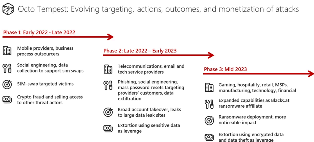
Figure 1. The evolution of Octo Tempest's targeting, actions, outcomes, and monetization

Octo Tempest is a financially motivated collective of native English-speaking threat actors known for launching wide-ranging campaigns that prominently feature adversary-in-the-middle (AiTM) techniques , social engineering, and SIM swapping capabilities. Octo Tempest, which overlaps with research associated with 0ktapus, Scattered Spider, and UNC3944, was initially seen in early 2022, targeting mobile telecommunications and business process outsourcing organizations to initiate phone number ports (also known as SIM swaps). Octo Tempest monetized their intrusions in 2022 by selling SIM swaps to other criminals and performing account takeovers of high-net-worth individuals to steal their cryptocurrency.