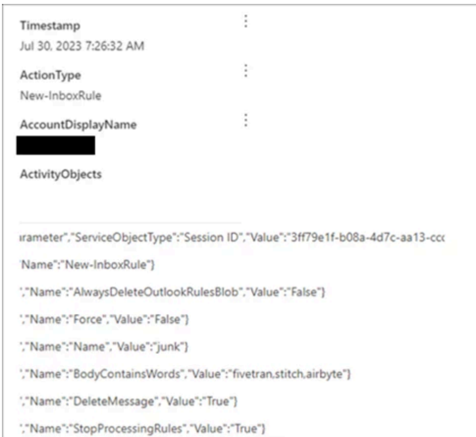
Figure 4. Inbox rule created by Octo Tempest to delete emails from vendors

To prevent identification of security product manipulation and suppress alerts or notifications of changes, Octo Tempest modifies the security staff mailbox rules to automatically delete emails from vendors that may raise the target's suspicion of their activities.