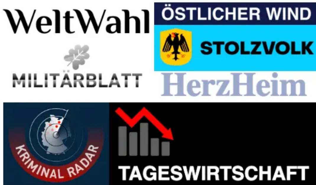
Figure 2: The seven new Doppelgänger brands targeting Germany and German-speaking audiences (Source: Recorded Future)

Each of the active websites uses distinct IP addresses, listed below, with the exception of weltwahl[.]com and stolzvolk[.]org , which both share 15.197.130[.]221. Administrators of these domains use web hosting provider resources provided by Hosting Concepts B.V. (d/b/a Registrar.eu), QHoster, NameSilo, Namecheap, or Vicetemple. Stolzvolk’s newest domain, stolzvolk[.]ac , uses web hosting services provided by Ultahost, Inc.