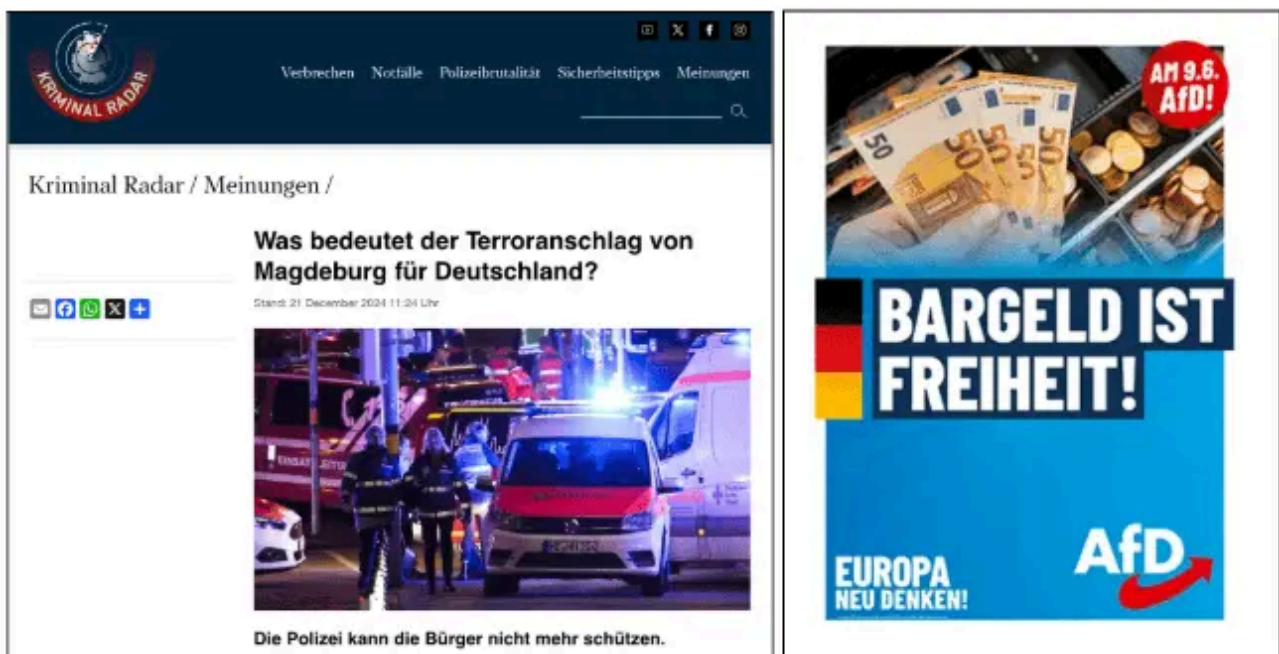
Figures 3 and 4: (Left) New Doppelgänger brand “Kriminal Radar”. (Right) Doppelgänger brand Tageswirtschaft shares an “advertisement” for Alternative für Deutschland. Doppelgänger has incorporated external links and images posing as advertisements to make the ad seem legitimate