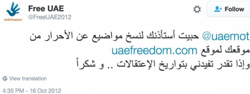
Figure 19: @FreeUAE2012 contacts @uaemot with a suspicious link on 16 October 2012

On 16 October 2012, we find the only tweet linking to uaefreedom.com . A Google search yields no links to the site and we found no passive DNS data available for this domain. The tweet was sent from account @FreeUAE2012 , directed at @uaemot . An individual based in Qatar was convicted in absentia on 25 December 2013 for running @uaemot . 93