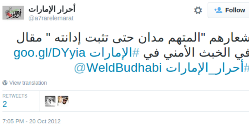
Figure 14: @a7rareleamarat targeted @WeldBudhabi with a malicious link on 20 October 2012

a7rareleamarat.com is a now-defunct website that purported to be an opposition web forum for discussing Emirati issues, and providing proxy tools for "hiding from the thugs" (presumably a reference to the UAE State Security Apparatus). We found four links involving aax.me posted by the site's Twitter account, @a7rareleamarat . We display two Tweets below, as the rest of the Tweets had the same links: