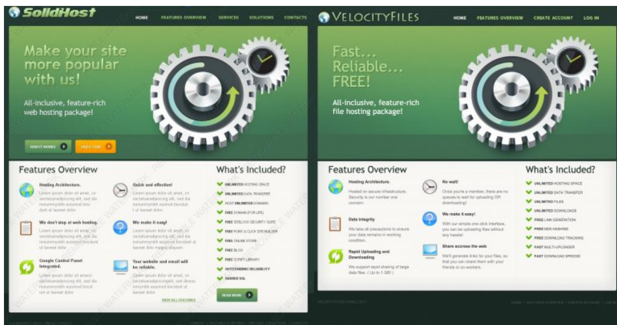
Figure 18: Comparison between web design template image (left) and VelocityFiles website (right).

The design of VelocityFiles appeared to be a loosely modified version of a public website design template. 90 Given that the site appears to be designed to pose as a public file sharing service, has no obvious public functionality, and was linked to through aax.me, we suspect that it may have been an attack site.