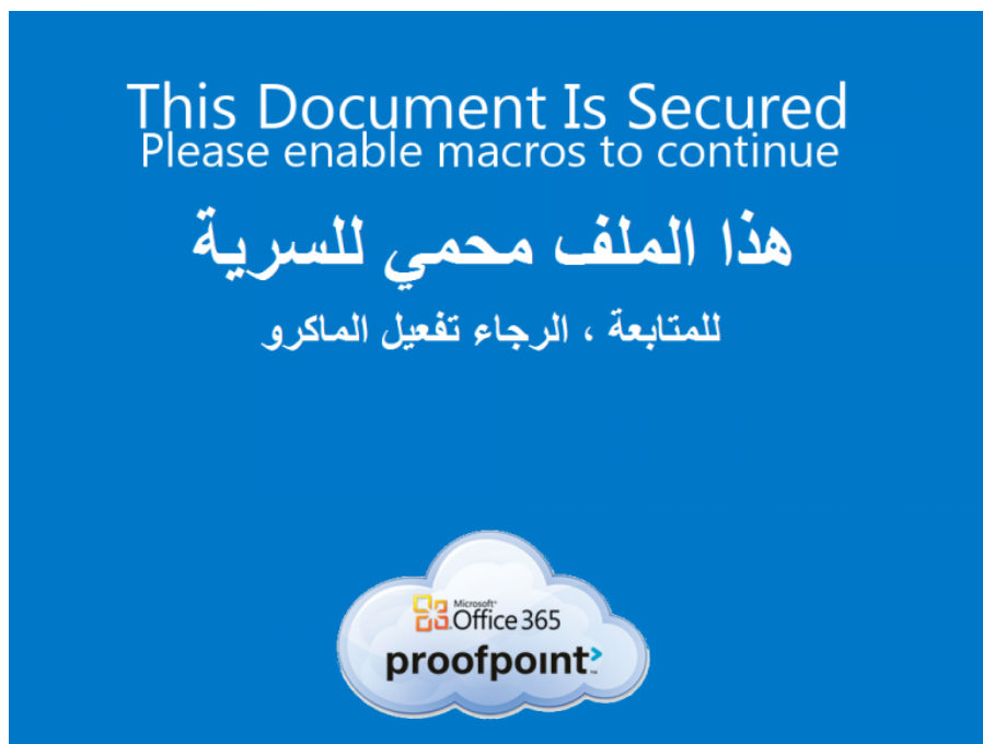
Figure 3: Fake Proofpoint image in the malicious document sent to Donaghy

When opened, the target is greeted with the following image, purporting to be a message from "proofpoint," a legitimate provider of security solutions for Office 365. 16 The image claims that " This Document Is Secured " and requests that the user " Please enable macros to continue. "