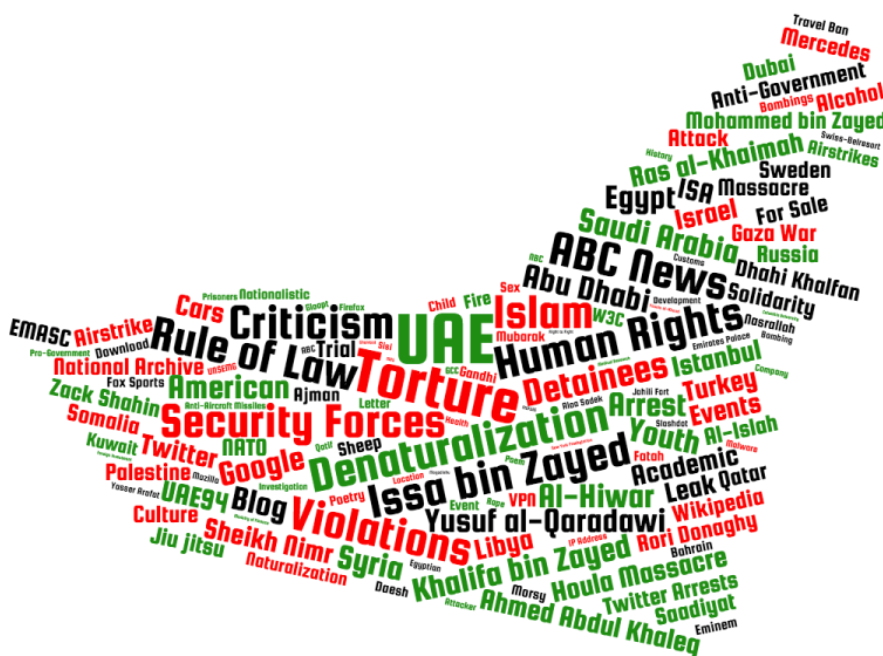
Figure 1: Tag cloud of bait content topics used by Stealth Falcon showing a strong emphasis on political topics and

The attack on Donaghy - and the Twitter attacks - involved a malicious URL shortening site. When a user clicks on a URL shortened by Stealth Falcon operators, the site profiles the software on a user's computer, perhaps for future exploitation, before redirecting the user to a benign website containing bait content. We queried the URL shortener with every possible short URL, and identified 402 instances of bait content which we believe were sent by Stealth Falcon, 73% of which obviously referenced UAE issues. Of these URLs, only the one sent to Donaghy definitively contained spyware. However, we were able to trace the spyware Donaghy received to a network of 67 active command and control (C2) servers, suggesting broader use of the spyware, perhaps by the same or other operators.