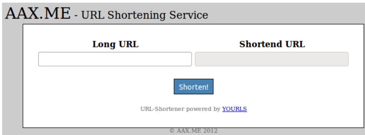
Figure 6: Homepage of aax.me

We were unfamiliar with the website aax.me , so we investigated it further. We found that the main page of aax.me purported to be a public URL shortening service, powered by YOURLS, 23 an open source PHP framework allowing anyone to set up their own URL shortening service. We are unable to ascertain whether the site actually uses any YOURLS code. We also noted that the homepage contains a typo ("Shortend [sic] URL").