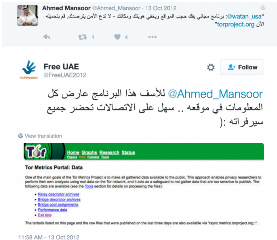
Figure 20: @FreeUAE2012 attempts to convince Ahmed Mansoor that Tor logs private information of its users

Three days later, @FreeUAE2012 attempted to convince Ahmed Mansoor that Tor Browser logged private information of its users, posting a screenshot of the Tor Metrics page, which provides non-sensitive data for researchers. 95