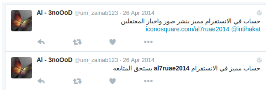
Figure 16: @um_zainab123 soliciting followers for Instagram account @al7ruae2014 on 26 April 2014

We noticed that one of the Twitter accounts that sent out aax.me links, @um_zainab123 , solicited followers for an Instagram account @al7ruae2014 .