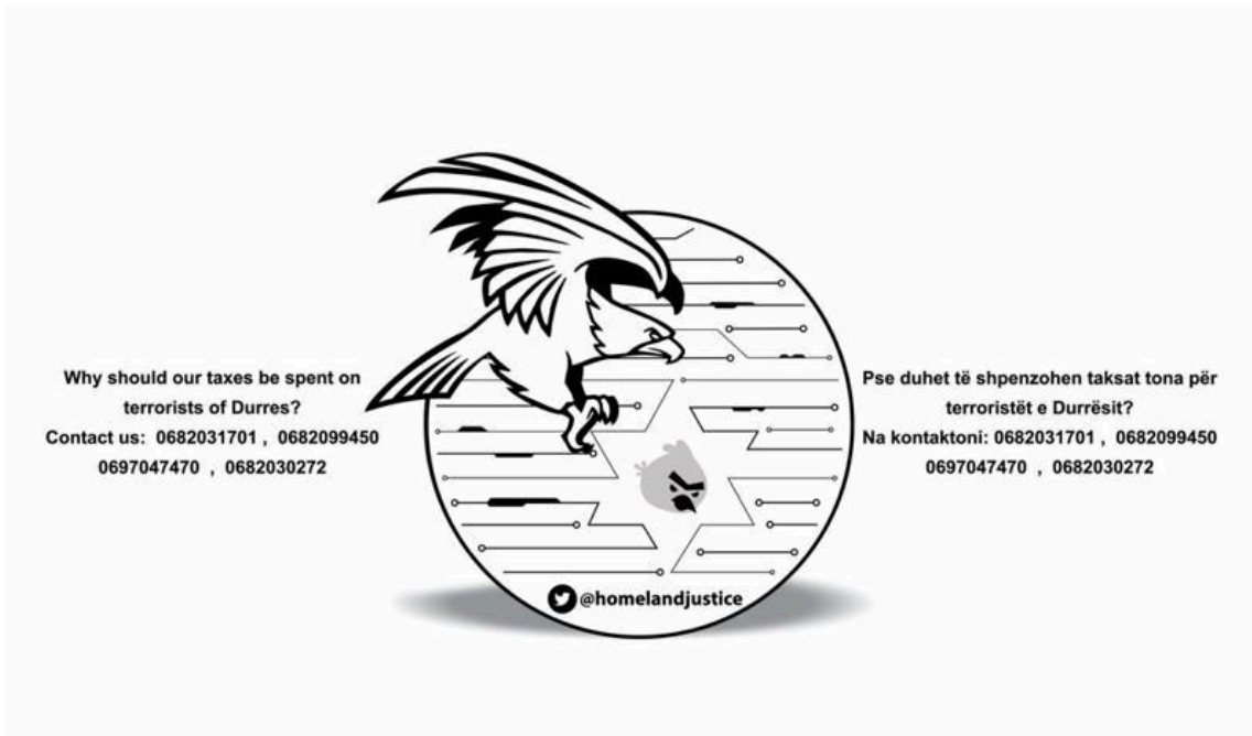
Figure 2: ROADSWEEP wallpaper and HomeLand Justice banner