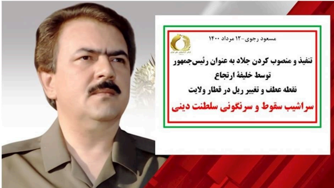
Figure 4: Image of Massoud Rajavi in a Word document used as decoy content alongside CHIMNEYSWEEP in August 2021