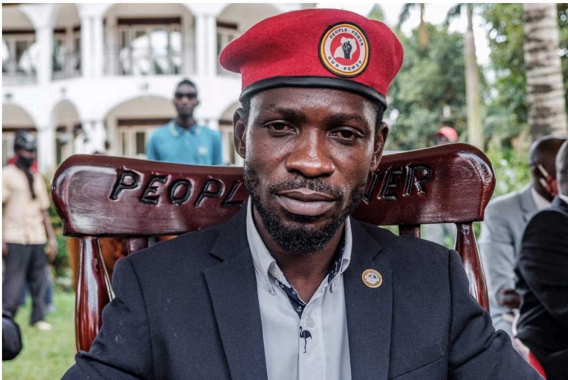
Bobi Wine

Across Africa , nations like Kenya, Mauritius, Uganda, and Zambia have embraced Huawei, infusing surveillance technology into the heartbeat of their urban landscapes. In Kenya, the Safe City project — powered by Huawei's system encompassing CCTV and facial recognition technologies — monitors Nairobi and other primary cities. In Uganda, one such case of surveillance reportedly led to the regime seeking to silence political opponent Bobi Wine, accomplished through the help of Huawei staff and services. These same capabilities can be found in many other countries throughout Africa.