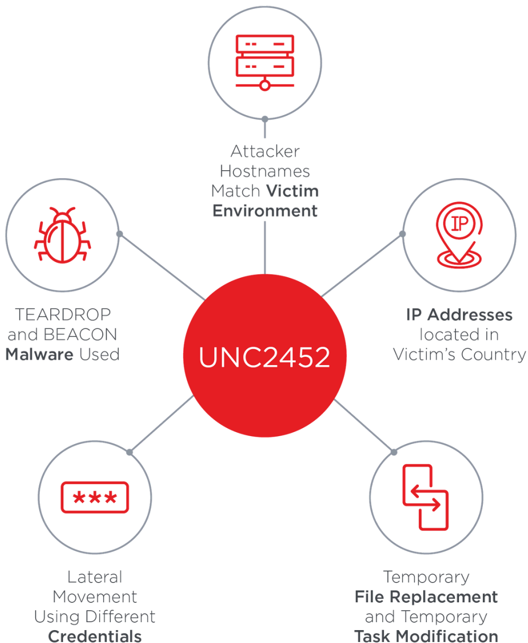
Figure 2: Post-compromise tactics

This section will detail the notable techniques and outline potential opportunities for detection.