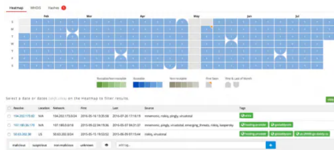
Figure 3 PassiveTotal screenshot showing associated IP addresses with snoozetime[.]info

All IP addresses in question are located within the United States.