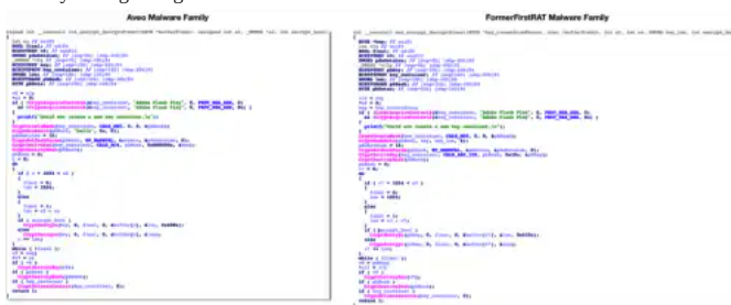
Figure 5 Comparison of encryption function between Aveo and FormerFirstRAT

To encrypt the provided data, the malware makes use of the RC4 algorithm, using a key of 'hello'. As shown in the following image, the encryption routines between Aveo and FormerFirstRAT are almost identical, with only the algorithms and keys being changed.