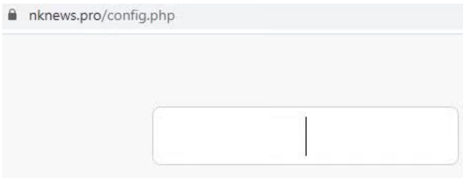
b374k login site