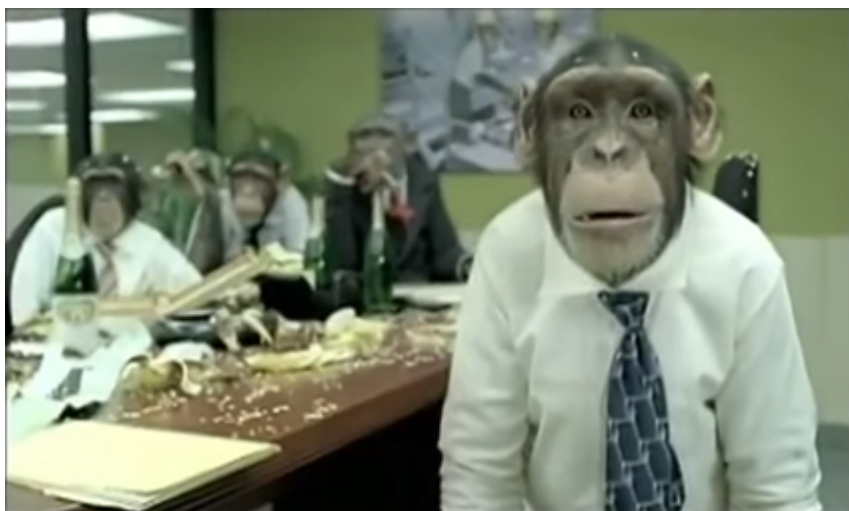
Figure 1. Cozyduke campaign used an “Office Monkeys” video as a lure–July 2014

The group began its current campaign as early as March 2014, when Trojan.Cozer (aka Cozyduke) was identified on the network of a private research institute in Washington, D.C. In the months that followed, the Duke group began to target victims with “Office Monkeys”- and “eFax”-themed emails, booby-trapped with a Cozyduke payload. These tactics were atypical of a cyberespionage group. It’s quite likely these themes were deliberately chosen to act as a smokescreen, hiding the true intent of the adversary.