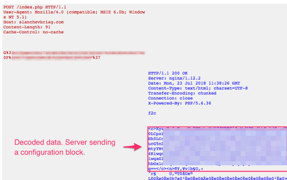
Figure 4: Initial client beacon followed by the server response (decoded by us manually)

As Figure 4 shows, there is a base64 string (configuration block) included in the server response between the “<c>” and “</c>” tags. It decodes to the following, revealing cryptocurrency strings of interest: