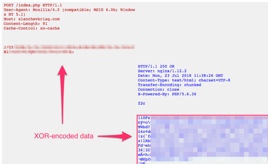
Figure 3: Initial client beacon followed by the encoded server response