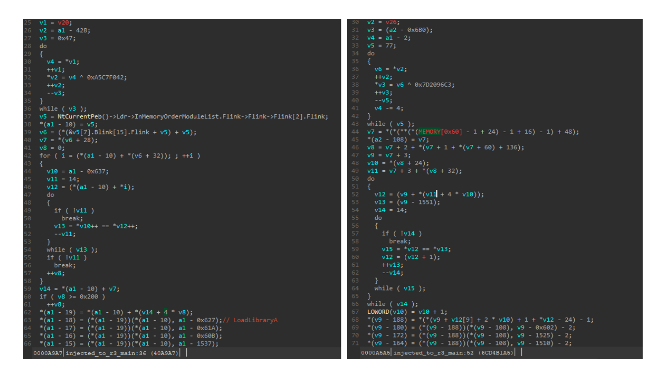
Left: Plurox SMB plugin injected code, right: WormDll injected code

This module is responsible for spreading malware over the network using the <u>EternalBlue</u> <u>exploit</u>. It is identical to the wormDII32 module from <u> Trojan.Win32.Trickster </u>, but with no debug lines in the code, plus the payload in the exploit is loaded using sockets.