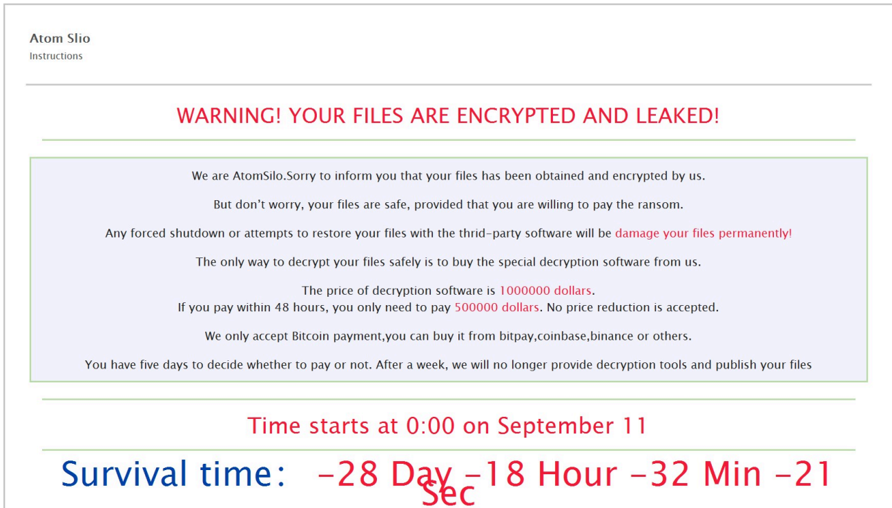
Figure 2: AtomSilo ransom note.

Below is the full content of the ransom note file dropped on my machine.