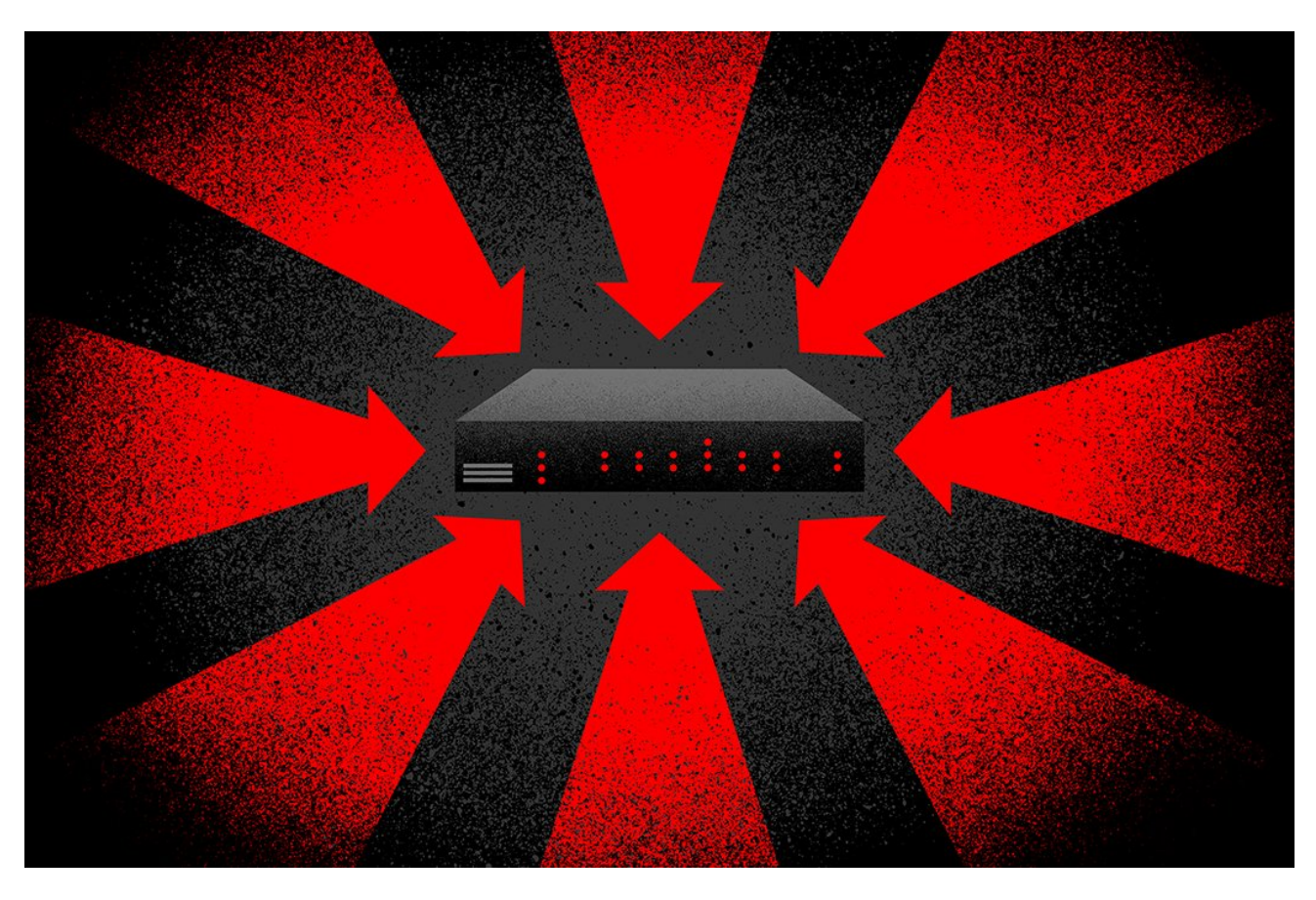
A Tale of Two Cookies: How to Pwn2Own the Cisco RV340 Router