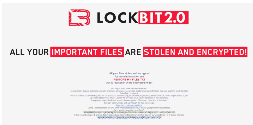
New LockBit 2.0 wallpaper recruiting insiders

With this relaunch, LockBit has also changed the Windows wallpaper placed on encrypted devices to offer "millions of dollars" for corporate insiders who provide access to networks where they have an account.