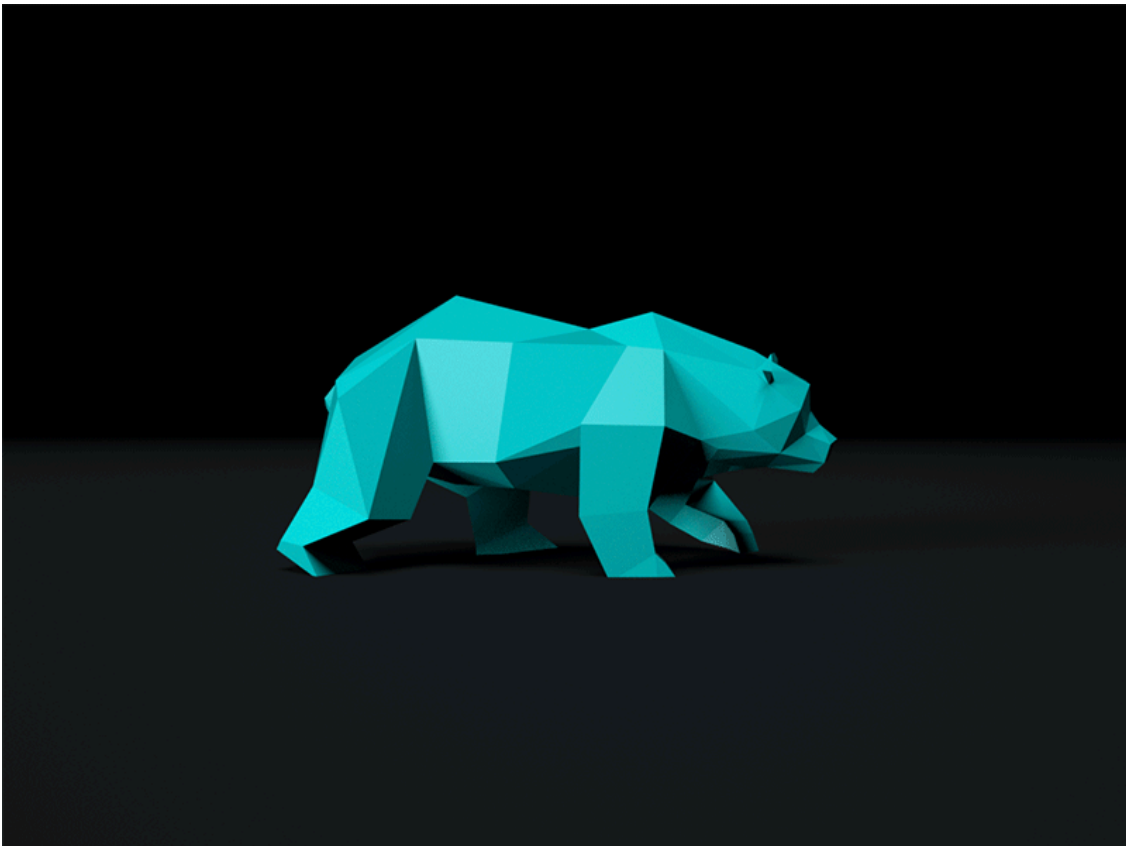
The artwork used to head this article is called 'Low Poly Bear' and it was created by Jeremiah Shaw .

[12] UNITED STATESDISTRICT COURT FOR THE DISTRICT OF COLUMBIA, "Case 1:18-cr-00215-ABJ," U.S. Justice Department, https://www.justice.gov/file/1080281/download , 2018.