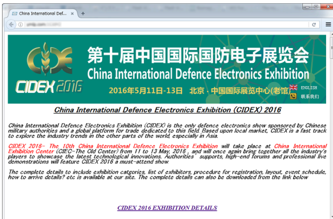
Figure 2. A customized website with content related to the Chinese military

The malicious sites link to files hosted on different domains, which appear to be solely used for malicious purposes. The domains are registered under names that pose as legitimate sources for Chinese intelligence. Several domains predominantly used in the attacks are hosted on two servers with the IP addresses 212.83.146.3 and 37.58.60.195.