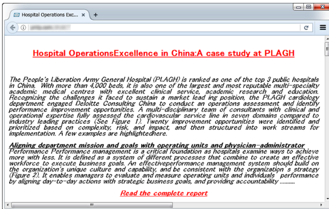
Figure 1. A customized website with content related to a Chinese public hospital