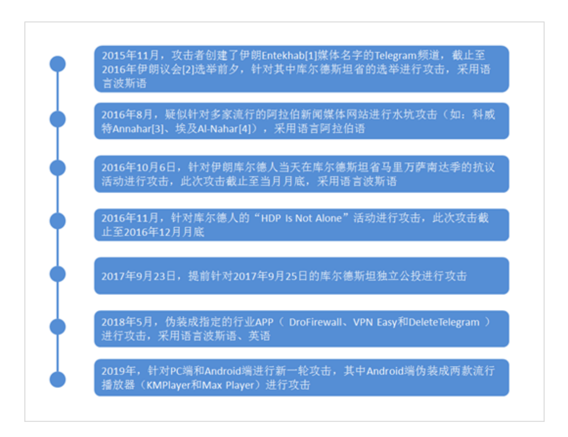
Figure 1.1 The time of the key attack activity of the saber lion