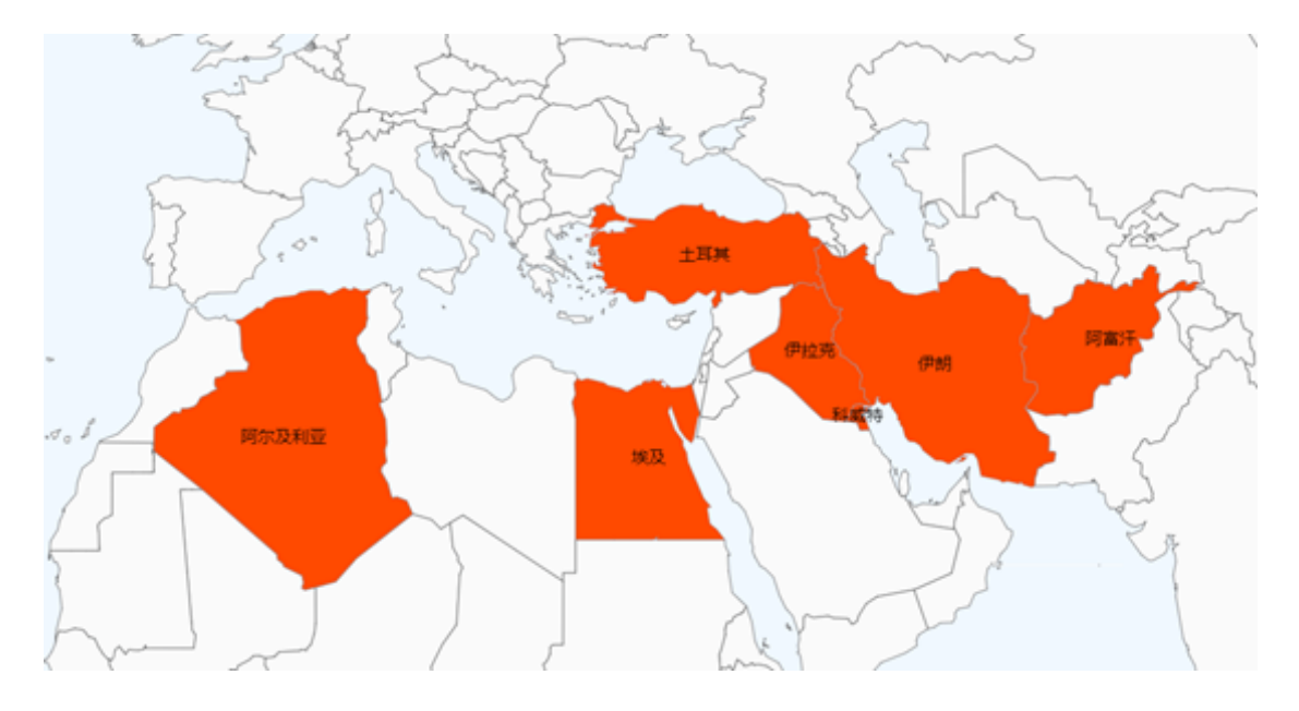
Figure 5.1 Distribution of the attacked area

Up to now, 360 Campfire Labs has found that there are 7 countries affected by the attack of the Saber Lions, of which Iran is the most affected. This is related to the attack on the Kurds who found the country during our analysis. It doesn't matter.