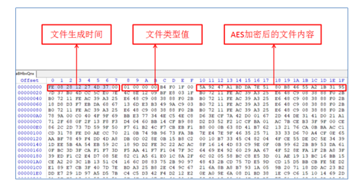
Figure 4.1 Example of a screenshot file stored in a uniform format

Table 3 Table of some file type values and file meanings