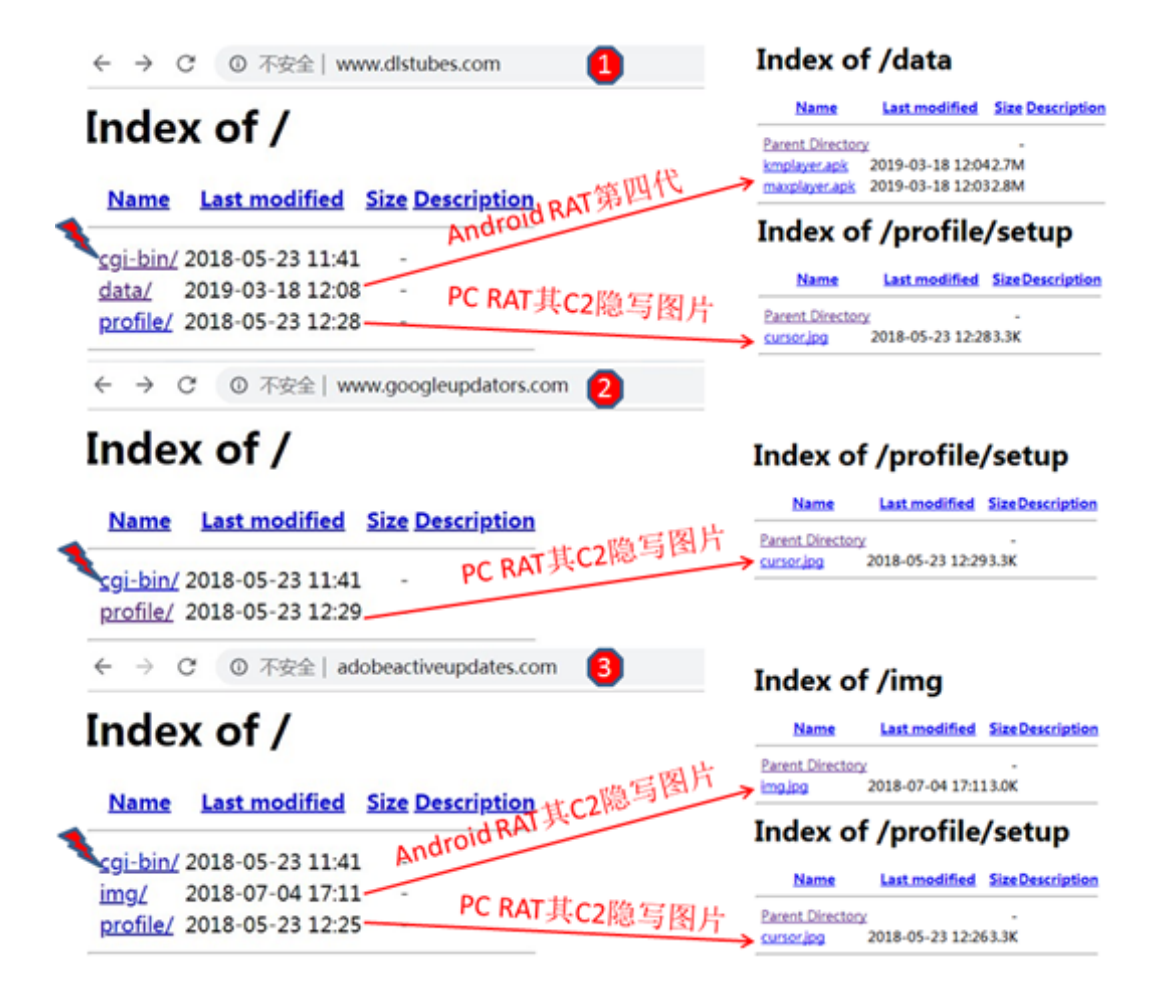
Figure 2.3 A batch of network infrastructure newly deployed by the Saber Lions organization in the month after being disclosed