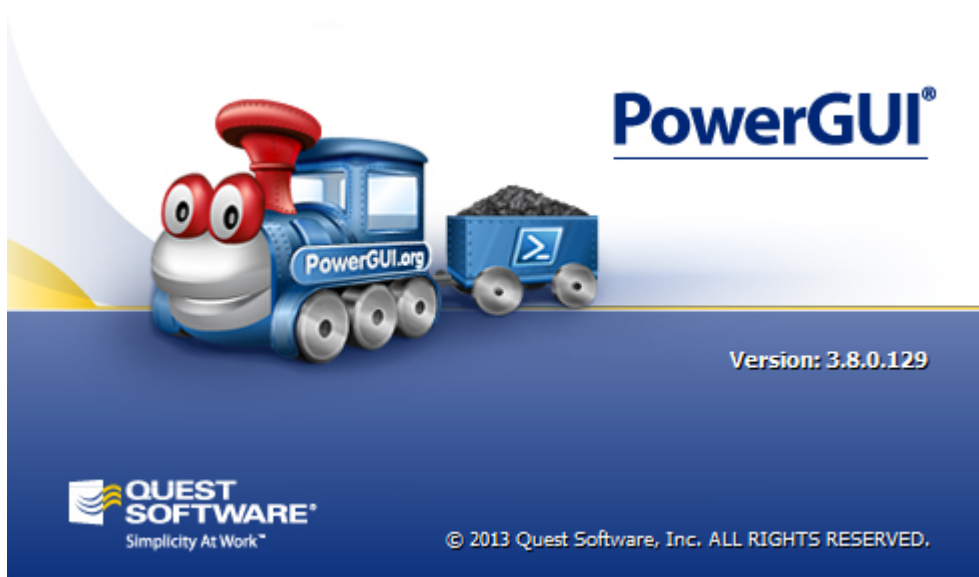
Figure 1: PowerGUI logo

The executable was built using PowerGUI from Quest Software. This tool allows the user to generate an executable that runs an embedded PowerShell script that is provided by the user.