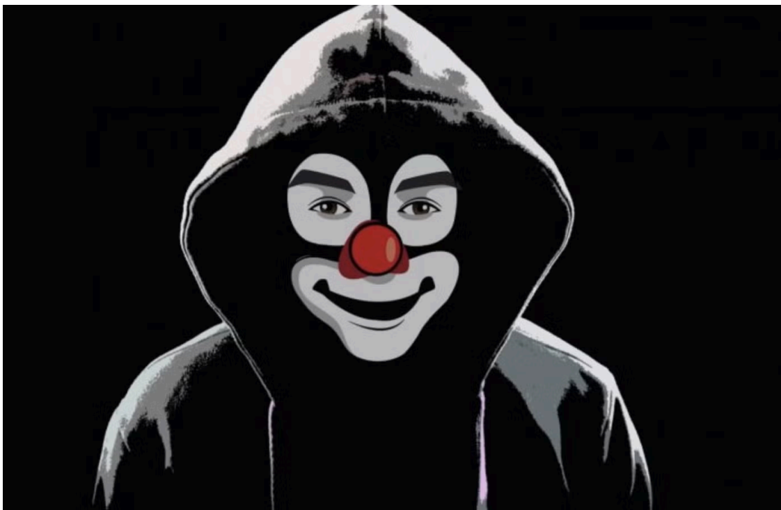
New Apostle variant wallpaper image

Other than the ransom demand note, the wallpaper picture used on affected machines was also changed, this time presenting an image of a clown: