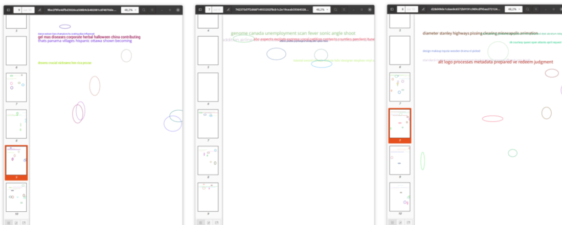
Figure 2. Garbage present in the last document pages

The last pages of the documents contain blobs of spirals and text, as shown below. SEKOIA.IO analysts still don't know why such gibberish is used as it appears useless as an anti-detection trick. However, the idea to put the phishing link in a PDF instead of in the email body prevents link analysis from email gateways and is a good tactic to remain undetected from an attacker point of view.