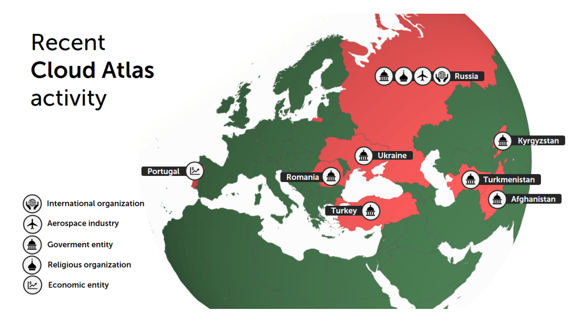
Countries targeted by Cloud Atlas recently

Cloud Atlas hasn't changed its TTPs (Tactic Tools and Procedures) since 2018 and is still relying on its effective existing tactics and malware in order to compromise high value targets.